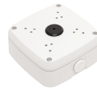
JBEW-121 Junction Box